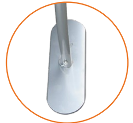
Heavy Duty Steel Foot Pad