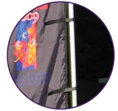
HOOK & LOOP STRAPS SECURE WALL TO LEGS