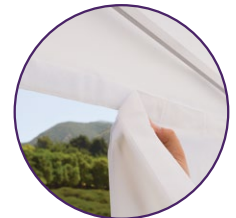
OPTIONAL VELCRO STRIP TO EASILY ATTACH WALL